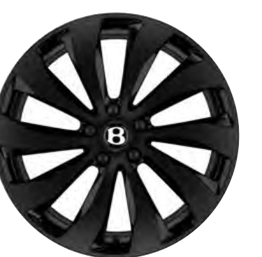
22" Ten spoke wheel – black painted