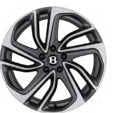
22" Ten swept spoke alloy wheel – grey painted and machined