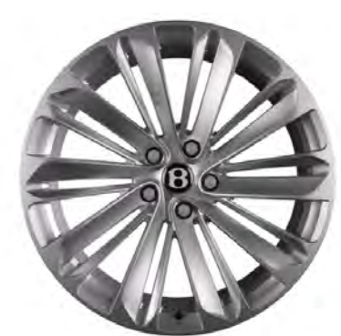
22" Speed alloy wheel – silver painted