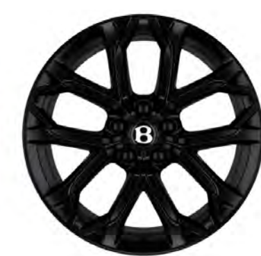
22" Sports alloy wheel – black painted