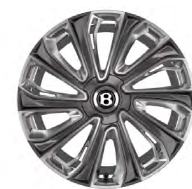
22" Mulliner alloy wheel – painted and polished with self-levelling badge