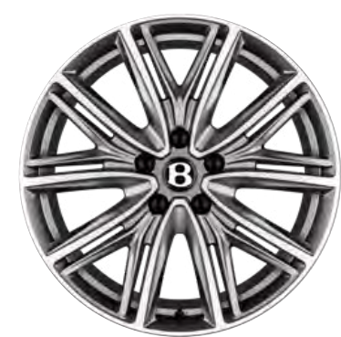
21" Ten twin-spoke wheel – grey painted and bright machined