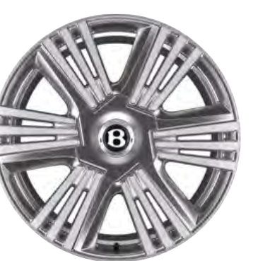
22" Azure wheel – silver painted and bright machined