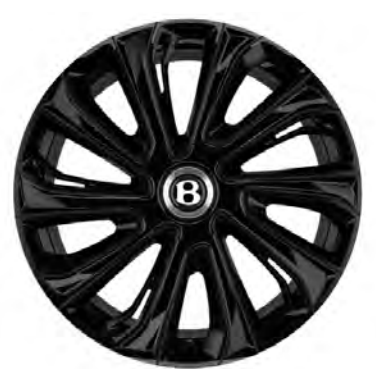
22" Mulliner alloy wheel – black painted with self-levelling badge