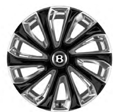
22" Mulliner alloy wheel – black painted and polished with self-levelling badge