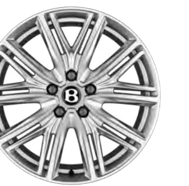
21" Ten twin-spoke wheel – painted