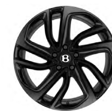
22" Ten swept spoke alloy wheel – black painted