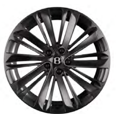
22" Speed alloy wheel – dark tint