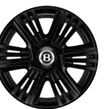
22" Azure wheel – black painted