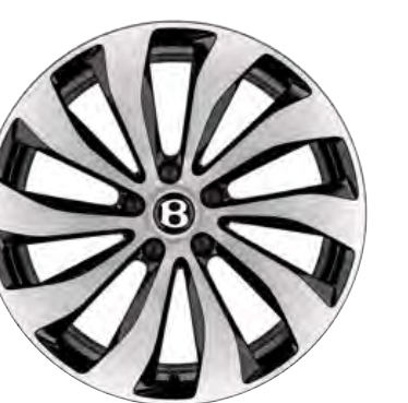
22" Ten spoke wheel – silver painted and bright machined