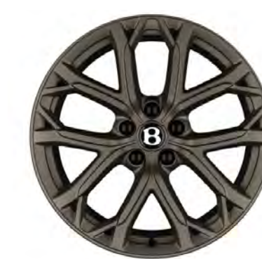
22" Sports alloy wheel – Pale Brodgar Satin