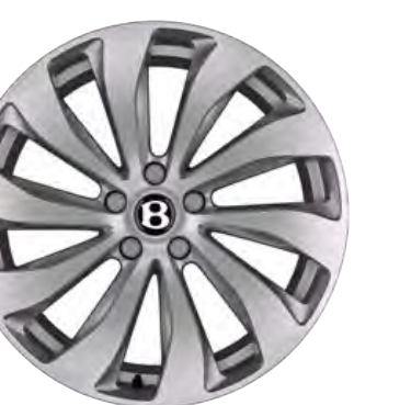
22" Ten spoke wheel – silver painted and bright machined