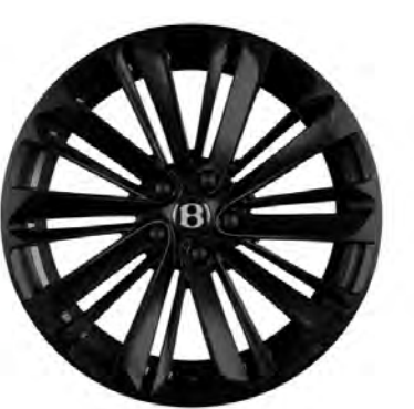
22" Speed alloy wheel – black painted